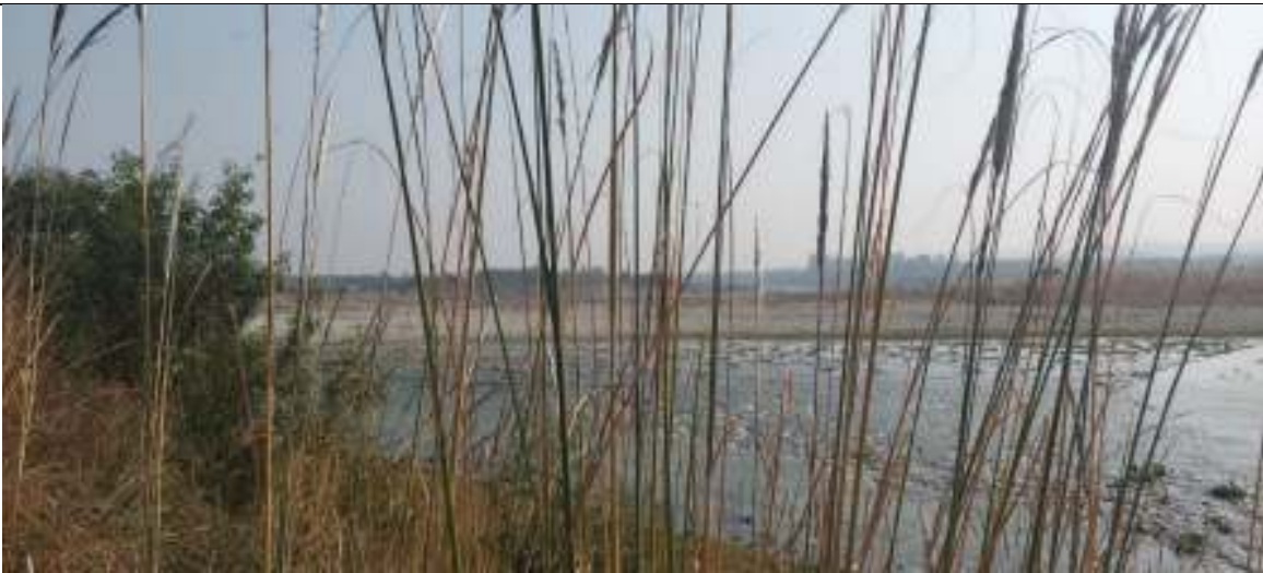
Plate 5 - Illegal Mining outside the EC area