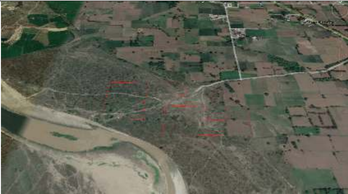
Plate 4 - KML file of mining site of village Bhallan