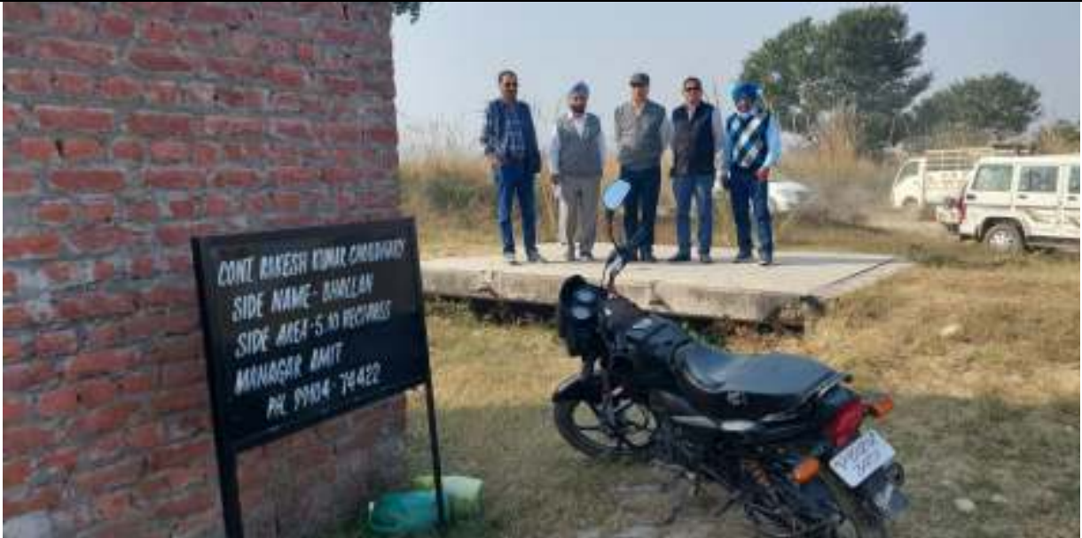
Plate 1- Mining site of Village Bhallan