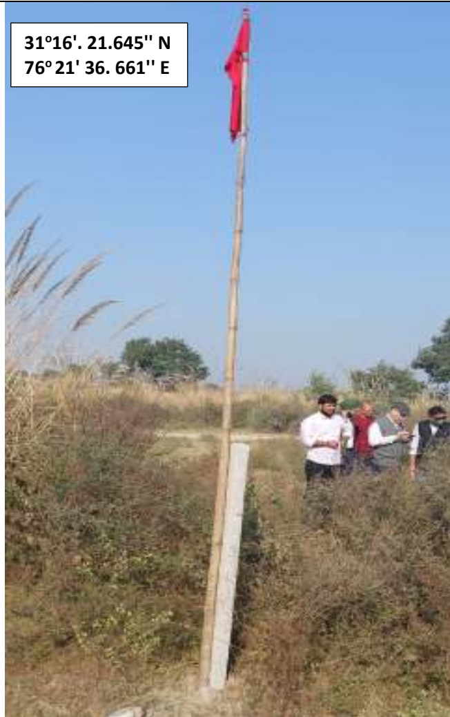
Plate 2- Mining site of Village Bhallan